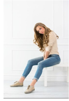
HI-RISE STRAIGHT LEG JEANS