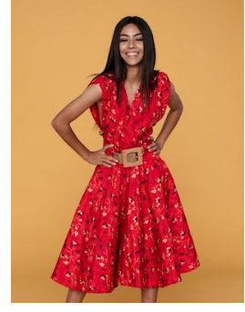
FLORAL PRINT DRESS