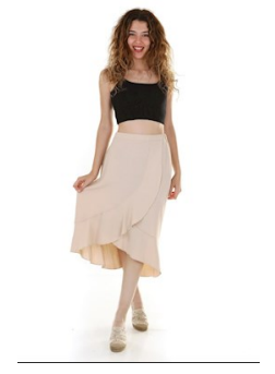
FLORAL PRINTED SKIRT