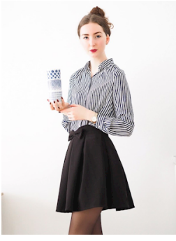
PRINTED PLEATED DRESS