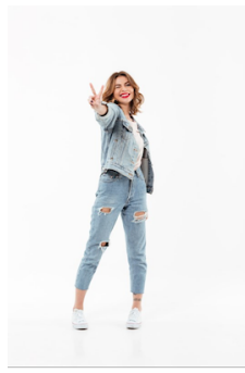
MOM FIT JEANS