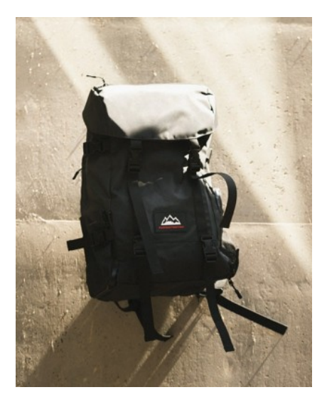
Black Mountain Backpack