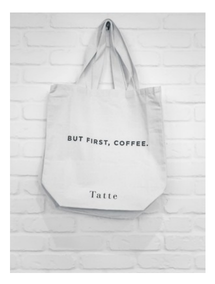
Plain Colored Tote Bag with Logo