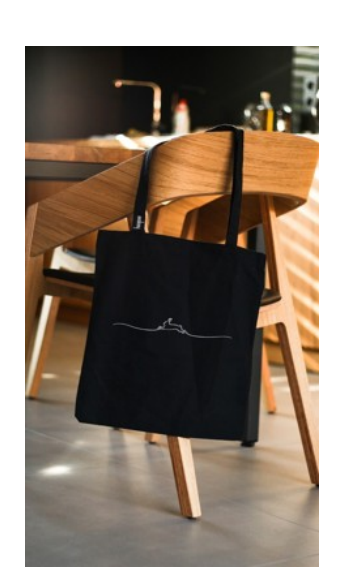
Black Tote Bag with Logo

Backpack Multifunctional Waterproof Travel Bag