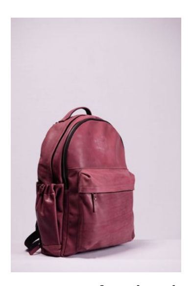
Water Proof Backpack