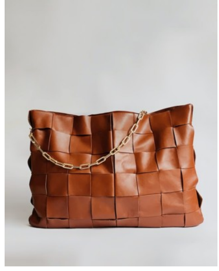
Brown Top Handle Hand Bag