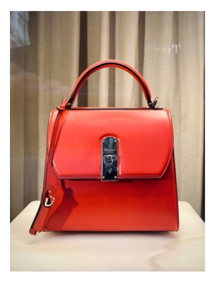
Red Leather Hand Bag

Slim Travel Backpack with Laptop Compartment