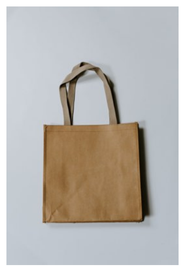
Brown Tote Bag Plain