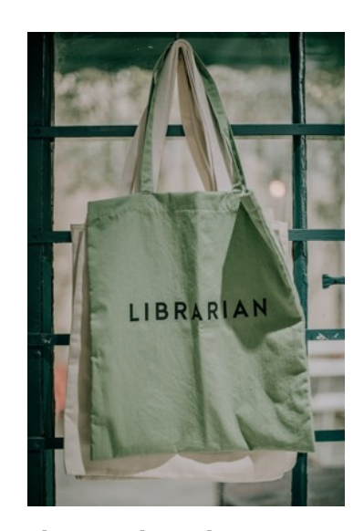
Plain Colored Tote Bag