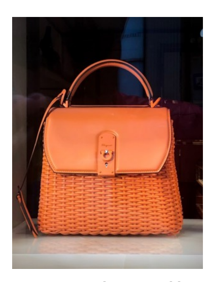
Orange Leather Hand bag