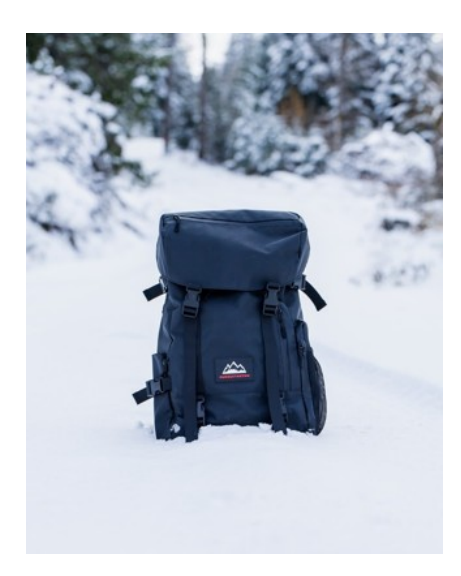
Navy Blue Mountain Backpack