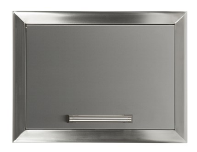
Drop in Cooler