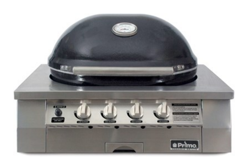
Primo Oval Gas 420