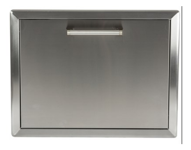
Pull Out Ice Chest