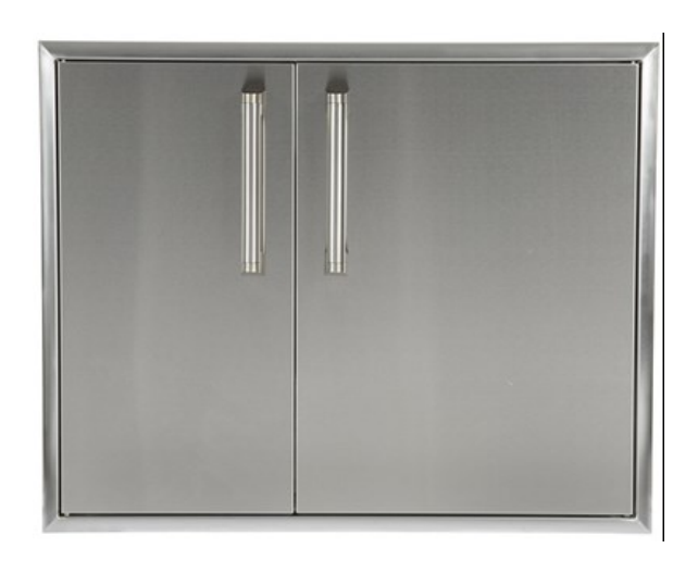
31" Dry Pantry

Cutout Dimensions: 23 3/8"(W) x 19-3/8"(H) x n/a"(D)