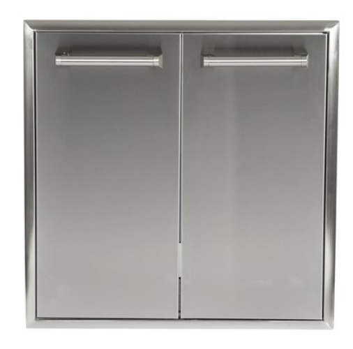
Dual Pull Out Trash And Recycle