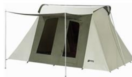
10 X 14 FT. FLEX-BOW SUPER DELUXE VX TENT