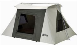
9 X 8 FT. FLEX-BOW CANVAS TENT