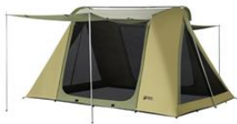
12 X 9 FT. CABIN BASIC