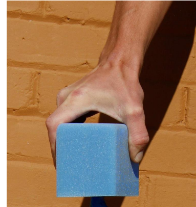
Suspend weights for systematic and quantifiable strength training.