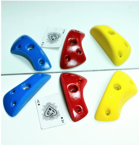
Left and right paired pinches, not identical but mirror image duplicates.

Specific ergonomically designed left and right handed pairs. Flip the holds and right becomes left and left becomes right; changing the thumb catch and altering the difficulty.