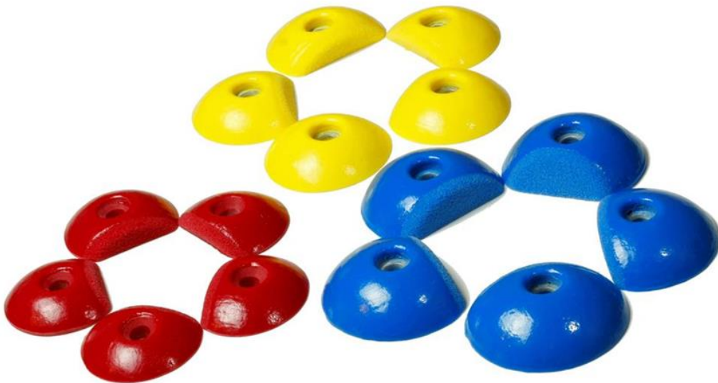
Shown Above: All three sizes, in dual texture