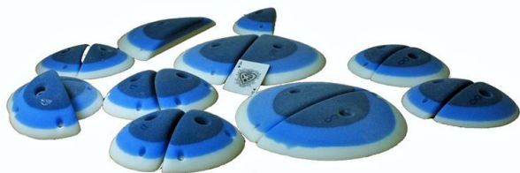
E-mail us at: info@driftlessclimbing.com to create your holds