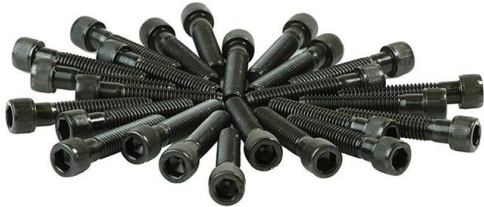
Purchase in packs of 25 or 100, high quality steel bolts. Available in 1.5, 2, 2.5 and 3 inch lengths.