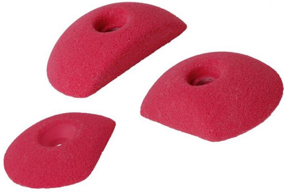
Pictured: Small, Medium, and Large Feet