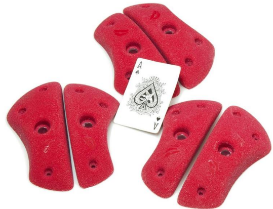
Sets of 6 holds, 3 pairs: A flat edge, 10 degrees in-cut and 10 degrees sloped.