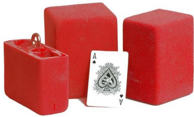
2, 3 and 4 inch blocks.