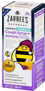
Zarbee's Naturals Children's Complete Cough Syrup + Immune Nighttime with Dark Honey & Elderberry, Natural Berry Flavor, 4 FL OZ 118 ML 4603453276226 9.19