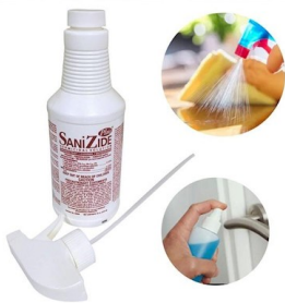
SaniZide 16 OZ Plus Disinfectant Solution Spray PROFESSIONAL GRADE Sanitizer 4566499524674 14.99