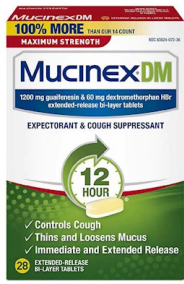
MUCINEX DM 12H 1200/60 28T 4392238186562 37.19