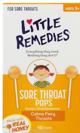
Little Remedies Sore Throat Pops, 10.0 CT 10 4603451998274 0