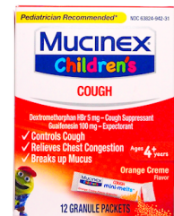
MUCINEX CHILD COUGH 4+ YEARS ORANGE CREME FLAVOR 12 GRANULE PACKETS 4 12 4392150007874 11.09