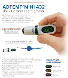
Adtemp mini 432 non-contact thermometer / 4391997505602 64.99