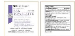
HENRY SCHEIN BZK Towelettes 100 PACKETS 4564130398274 5.99