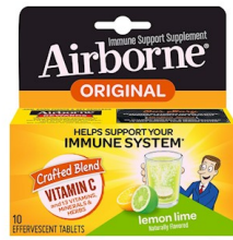
Airborne Vitamin C Effervescent Tablets, Lemon Lime - 10 ct C 10 4392179892290 8.09