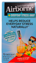
AIRBORNE + EVERYDAY STRESS AWAY ZESTY ORANGE 16 POWDER PACKETS 4577758806082 13.99