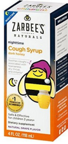
Zarbee's Naturals Children's Cough Syrup with Dark Honey Nighttime, Natural Grape Flavor, 4 FL. OZ 4 FI OZ 4392216625218 9.19