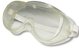
JOINTOWN SAFETY GOGGLE 4572907077698 2.99