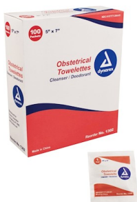
Dynarex Obstetrical Towelettes 100 PACKETS 4564081279042 3.49