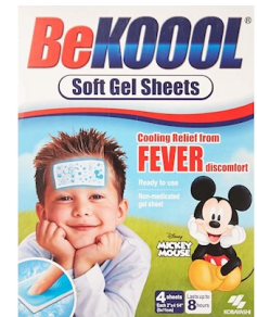
Be Kool Soft Gel Sheets for Kids, 4 count 4 4391864860738 3.99