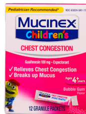
MUCINEX CHILDREN'S CHEST CONGESTION 4+ YEARS BUBBLE GUM FLAVOR 12 GARNULE PACKETS 4 12 4392149975106 11.09