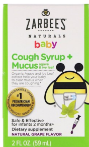
Zarbee's Baby Cough Syrup + Mucus Reducer Grape 2.0 fl oz 59ml 4391864434754 8.29