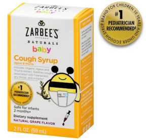
Zarbee's Naturals Baby Cough Syrup with Agave & Thyme , Natural Grape Flavor, 2 Fl. Ounces 4391864467522 9.19