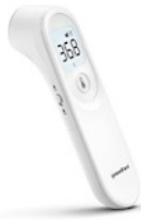
YUWELL Infrared Thermometer YT-1 4564019019842 64.99