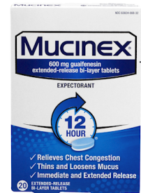
MUCINEX 600MG 20TAB 12*20 4391870234690 15.59