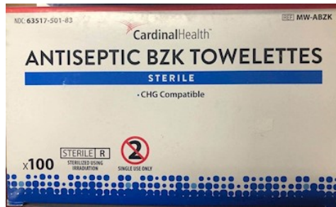
Cardinal Health antiseptic bzk towelettes 100 4564149567554 5.99