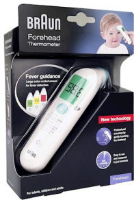
BRAUN FOREHEAD THERMOMETER BFH125 4584079261762 49.99