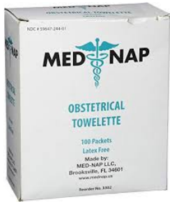
MED NAP Towelette Obstetrical AlcFr/BZK Cl .4% 5x7 Ctrs Dsp 100 4564172636226 4.99