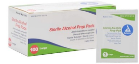
Dynarex Alcohol Prep Pads Large Size 100/box 100 4605482532930 3.99