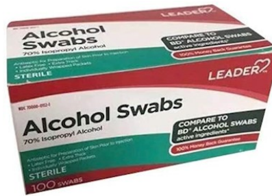
Leader Alcohol Swabs 70% Isopropyl Sterile, 100 Swabs 100 4392081031234 2.99