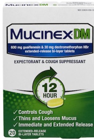
MUCINEX DM 20TAB 4391870103618 16.99