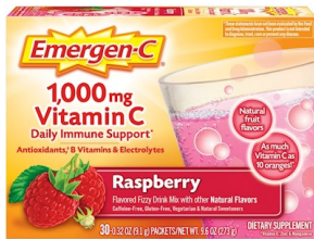
Emergen-C 1000mg Vitamin C Powder Raspberry Flavor C 30 4392328396866 12.69