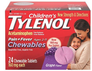
Tylenol Children's Pain + Fever Chewable Tablets Grape - 24 ea 4603503312962 8.49