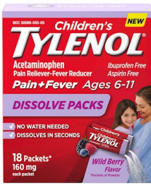
Children's Tylenol Acetaminophen Dissolve Packs, Wild Berry, 18 ct 6-11 18 4603434434626 8.79