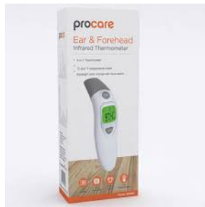
Procare IR Thermometer / 4564028948546 39.99