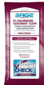
Sage 2%Chlorhexidine Gluconate (CHG) Cloths 2 4566532915266 2.99