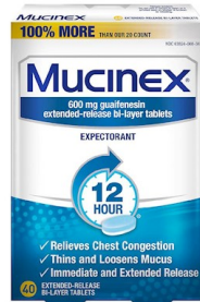
Mucinex 600 mg 12 h 40 tables 12*40 4577558331458 25.49