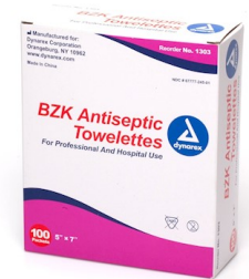
Dynarex BZK Antiseptic Towelettes 100 PACKETS 4564093403202 3.49