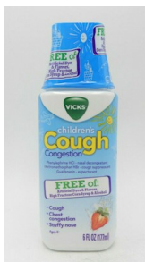
Vicks Children's Cough & Congestion Day Relief Liquid - Dextromethorphan - 6 fl oz Vicks 177ml 4603533099074 10.49