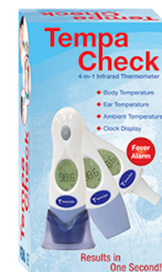
Tempa Check 4 In 1 Digital Thermometer 41/ 4564035600450 39.99