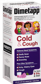
Children's Dimetapp Cold & Cough, For Ages 6 Yrs. & Over Grape 8.0 fl oz 6 237ml 4391865253954 12.19