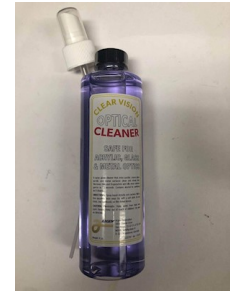
ARGON CLEAR VISION OPTICAL CLEANER 8 OZ 4566606413890 9.99