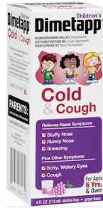
Children's Dimetapp Cold & Cough 4 fl. oz. Grape Flavor Ages 6+ 6 118ml 4391865188418 7.19