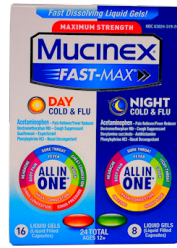
MUCINEX FAST MAX COLD & FLU DAY AND NIGHT LIQUID GELS 24 GELS 4608213909570 19.99