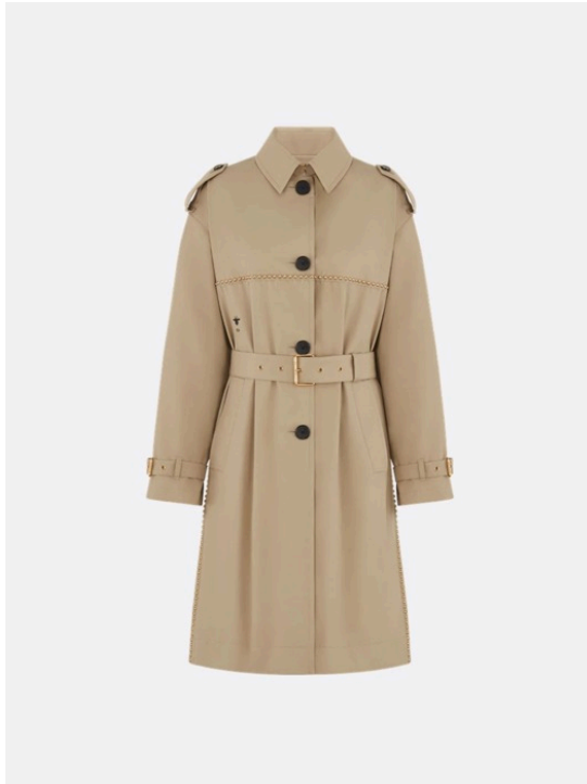
Embroidered Trench Coat