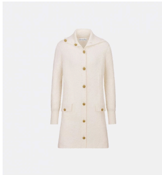
Long Cardigan Dress