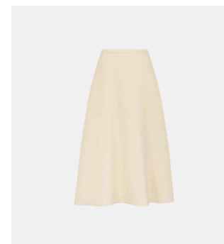
Flared Midi-Length Skirt