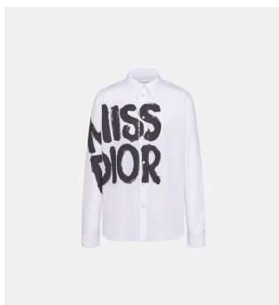
Miss Dior Blouse