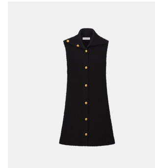
Long Vest Dress