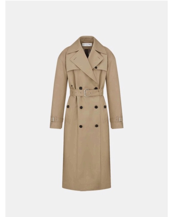
Belted Trench Coat