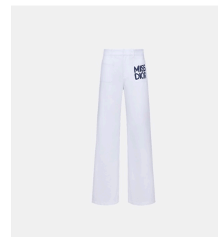
Miss Dior Flared Pant