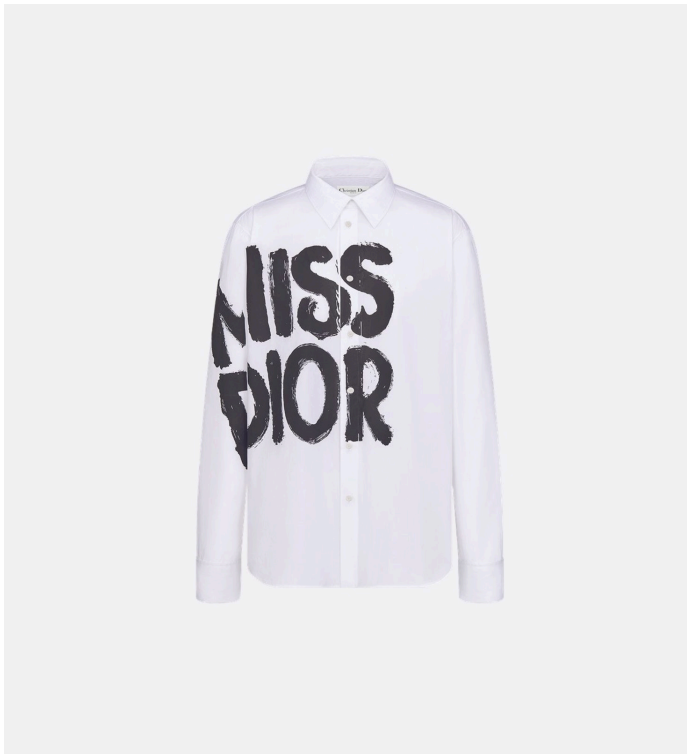
Miss Dior Blouse