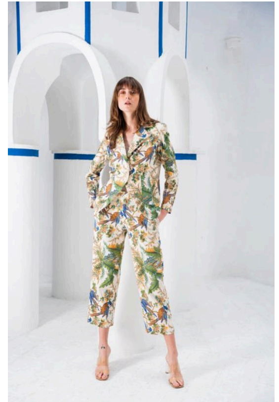
MATEO CO-ORD SET