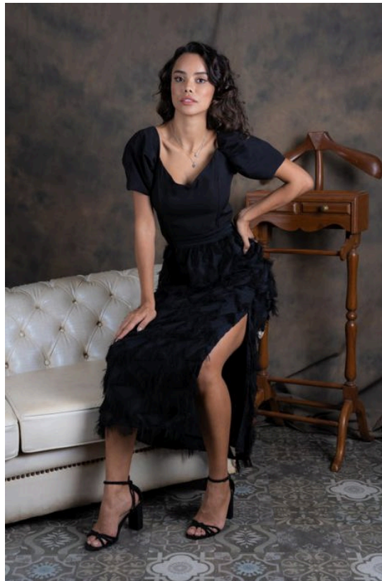
ROSALEE CO-ORD SET