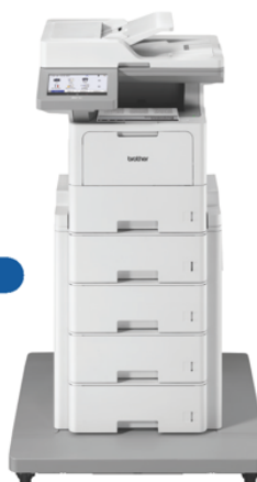
MFC-L6915dw ALL-IN-ONE SHOWN WITH TOWER TRAY OPTION