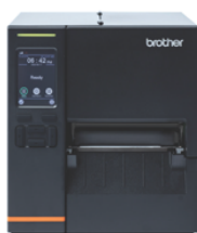
TJ-4021TN / TJ-4121TN

Up to 10" per second 20 Up to 600 1-inch labels per minute 19