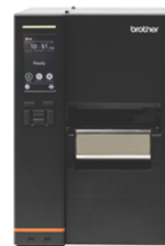
TJ-4422TN / TJ-4522TN

Up to 14" per second 20 Up to 600 dpi print resolution Up to 840 1-inch labels per minute 19