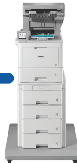
PRINTER SHOWN WITH OPTIONAL TOWER TRAY, CONNECTOR, AND STAPLER FINISHER