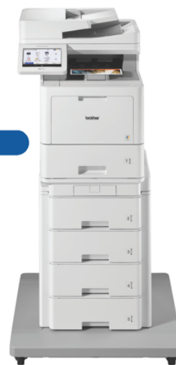
ALL-IN-ONE SHOWN WITH OPTIONAL TOWER TRAY AND CONNECTOR