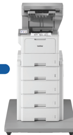
HL-L6415dw PLUS TOWER TRAY AND STAPLER FINISHER OPTIONS