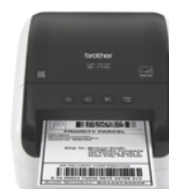
QL-820NWB / QL-820NWBc