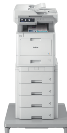
MFC-L9570cdw PLUS TOWER TRAY WITH CONNECTOR OPTIONS