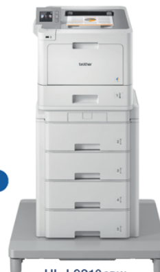
HL-L9310cdw PLUS TOWER TRAY WITH CONNECTOR OPTIONS