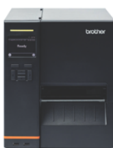
TJ-4420TN / TJ-4520TN TJ-4620TN

Up to 10" per second 20 Up to 600 1-inch labels per minute 19